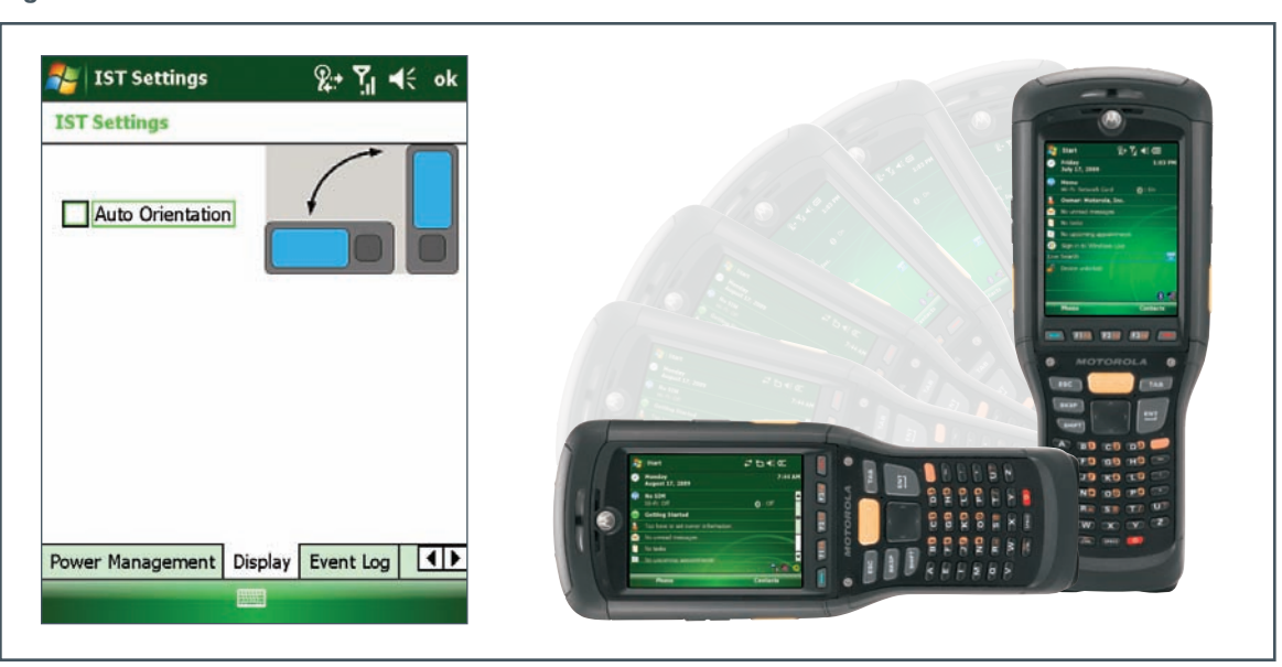
Figure 2: IST Screen Orientation Tab

These two features work hand in hand with the MC9500-K system power settings to provide enterprises with unprecedented power-saving functionality — the ability to preserve power every moment the device is not in use. As a result, battery life is maximized, preventing users from running out of battery power during a shift, protecting the productivity of your workforce — and business continuity.