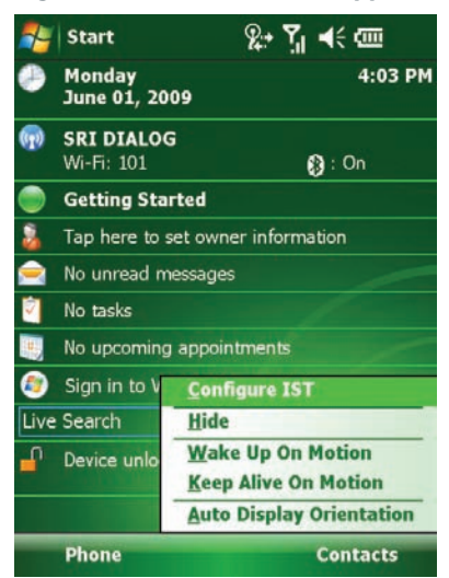
Figure 1: IST Control Panel Applet

Since the IST system tray icon is displayed in the Windows taskbar, a single 'tap' of a finger or stylus provides instant access to the applet.